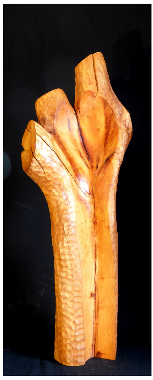
GEBORGEN 86 x 29 x 22 cm PRICE € 490