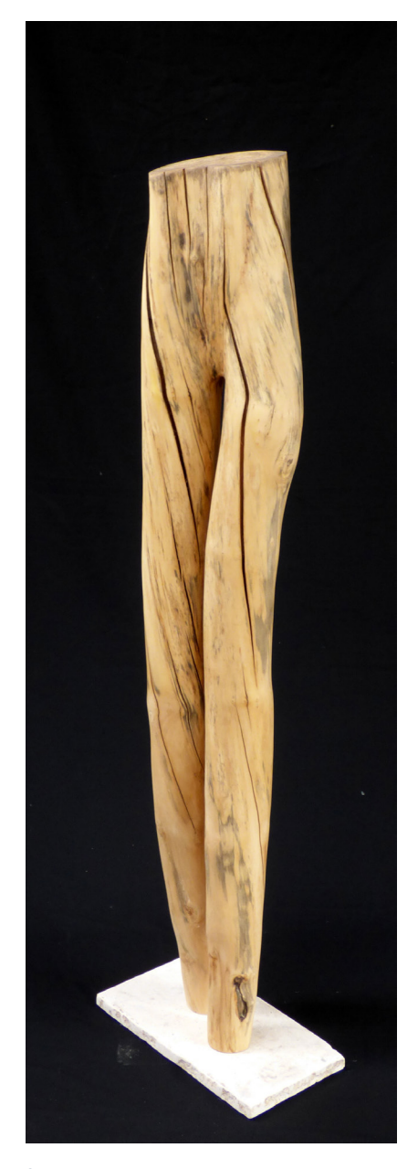
SHE 140 x 40 x 40 cm PRICE € 690

In my creations, simplicity, nature, and tranquility take center stage. I steer clear of unnecessary embellishments, opting instead for flowing, natural lines—an open invitation to connect with nature, the material, and one's own emotions. Whether through my outdoor installations or smaller indoor sculptures, my work aims to provide a soothing, positive, and sensitive experience."